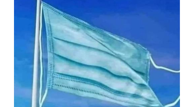
The Official Flag of 2020